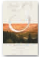
2006 Unoaked Chardonnay