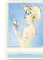
2004 Northwest White