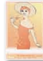
2008 Northwest Rose