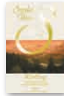
2007 Riesling - Cobble Hill