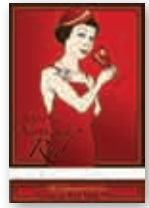
2004 Northwest Red